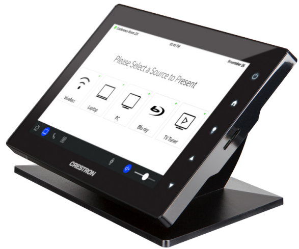
TSW-760-B-S with TSW-760-TTK-B-S Tabletop Kit

High-performance streaming video capability makes it possible to view security cameras and other video sources right on the touch screen. Native support for H.264 and MJPEG formats allows the TSW-760 to display live streaming video from an IP camera, a streaming encoder (Crestron CEN-NVS200 , DM-TXRX-100-STR , or similar [3] ), or a DigitalMedia™ switcher . Video is delivered to the touch screen over Ethernet, eliminating the need for any extra video wiring.